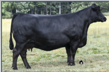
MAGS BETHANY DAM OF LOT 105A & 105B EMBRYOS