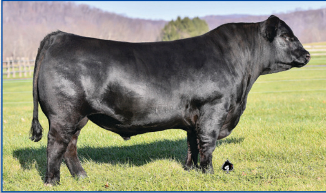
COLE GENESIS 86G FULL SIB TO LOT 7A AND SIRE OF LOTS 7B & 7C EMBRYOS