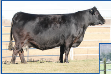
CJSL 4357B DAM OF LOT 7B EMBRYOS