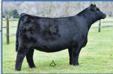
TMCK EARTH ANGEL 433E DAM OF LOT 7C EMBRYOS