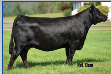
MAGS APPLAUSE 301A DAM OF LOT 106A & 106B EMBRYOS